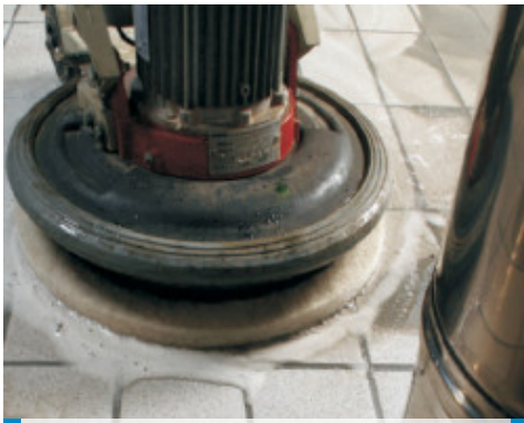
Cleaning off Kerapoxy P with water and a single head rotary machine with Scotch-Brite®