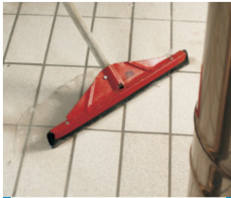
Cleaning off the flooring surface with a rubber raker