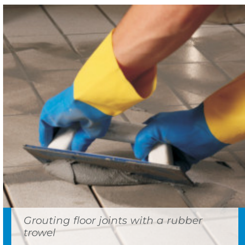
Grouting floor joints with a rubber trowel

If too much time has elapsed after laying and Kerapoxy P has already started to set, add 10% alcohol to the cleaning water.