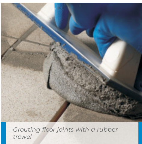
Grouting floor joints with a rubber trowel